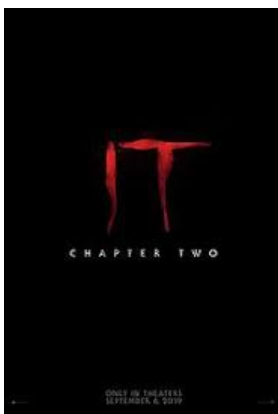
It: Chapter Two [R]