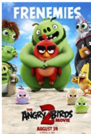
The Angry Birds Movie 2 [PG]

FREE COMMUNITY EVENT Sponsored by Conservation Nebraska Chasing Coral Monday, September 16 th 6:30 PM Seating based on availability